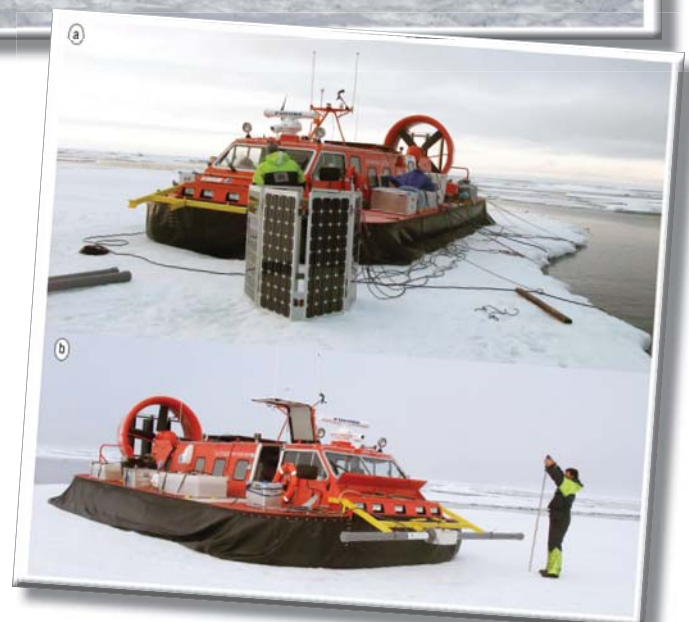
Figure 3. (a) The Sabvabaa on the ice pack. Open water presents no problem, and the weight loading does not crack the ice. (b) The EM-31 ice-thickness system, which consists of an assembly of coils for the transmission and reception of low-frequency EM fields, and a laser altimeter.

Although the seismic capabilities may seem pretty low key to the petroleum geophysical community, one should keep in mind several facts. First, the deep Arctic Ocean is a very quiet place; the ambient noise is 10 dB below sea state zero. Second, until 2003, there were only about 20,000 line kms of mostly single-channel seismic available, of which Hall collected some 4000 km from Ice Island T-3 with a home-built seismic profiler that used a 9kJ sparker as a source, getting up to 3.5 s penetration. And third, the hovercraft is primarily intended to operate in areas of very thick ice, laced with long open leads, where icebreakers have yet to penetrate, and