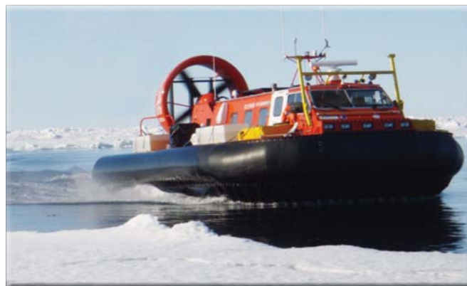
Figure 1. The research hovercraft R/H Sabvabaa crossing an open lead on the ice pack north of Svalbard over the Yermak Plateau.

The hovercraft was specially designed for Arctic conditions. It has double windows and 5 cm of insulation. A forward-looking, infrared (FLIR) sensor allows night vision. A full Furuno navigation suite with radar and map display is installed, together with marine and aircraft VHF radios, as both base stations and mobile units, and three Iridium satellite telephones with Internet and data-transmission capabilities. A local area network provides navigational information to up to eight laptop computers, operating off the science battery bank that is charged by a rooftop solar panel. There